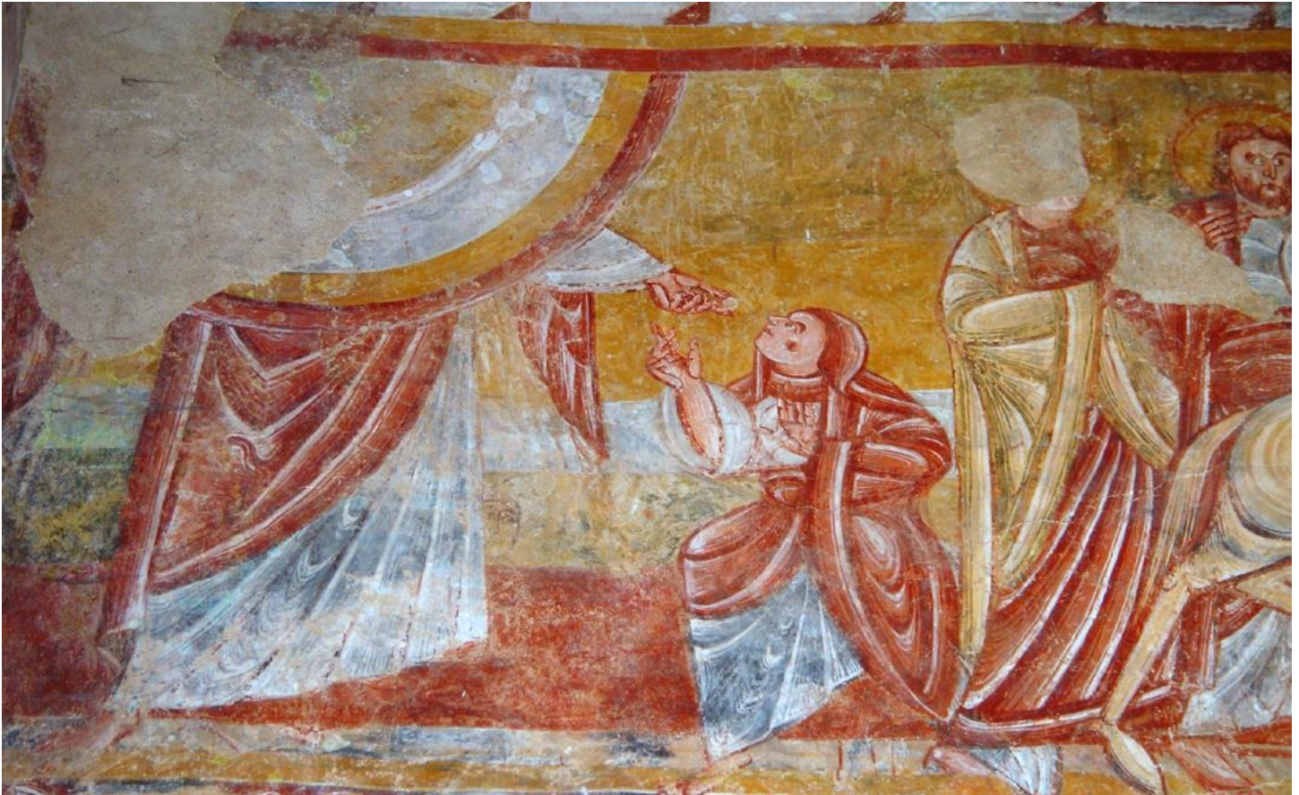
Fresco in St. Martin Church, Nohant-Vic France

New to Hunter? Here's some information to help you feel at home. Where you see asterisks in the bulletin, you're invited to stand. When we pass the peace, you're invited to greet those around you with a joyful sign of Christ's peace. All children are welcome to come forward for the sharing with young disciples. When we share our joys and concerns, feel free to join in. We offer a nursery for newborns through 3-year-olds. Thank you for visiting Hunter. We're glad you're here! Before you leave, please sign our guestbook in the narthex.